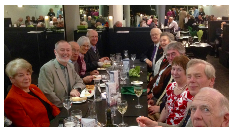
Pre-concert dinner at the Sage Brasserie. before enjoying the RAF concert celebrating the Battle of Britain.

Performers taking a bow at the Sage. We plan to have another musical event later in 2016.