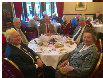
A group of members enjoying the Christmas lunch in the Strauss Room at the County Hotel.