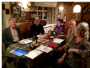
(Below) The Committee at work!