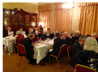
Society members (above) tackle the quiz at the Annual Dinner.